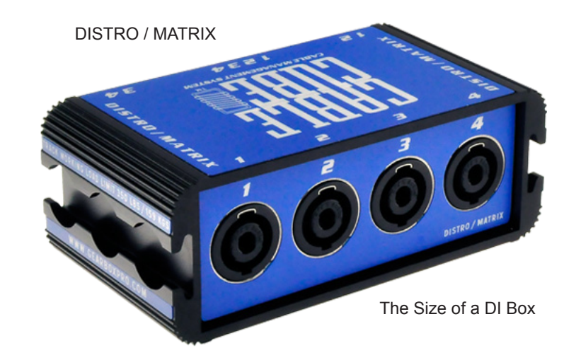
Cable Cube® carries the Gear Box Pro "Road Warrior Certification" for the serious professional.

Rating also applies to previously released product labeled "Track not load rated"